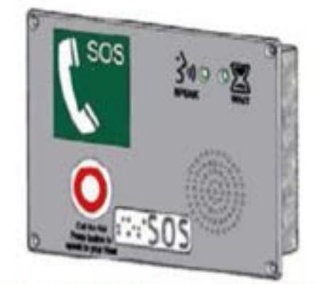
Figure 3 PRM Intercom (IPEP PMR)