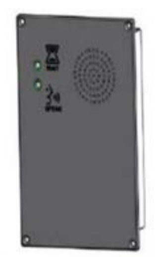
Figure 4 Passenger Intercom (IPEP)