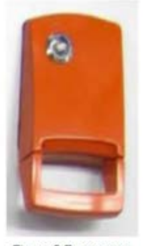
Figure 5 Emergency handle